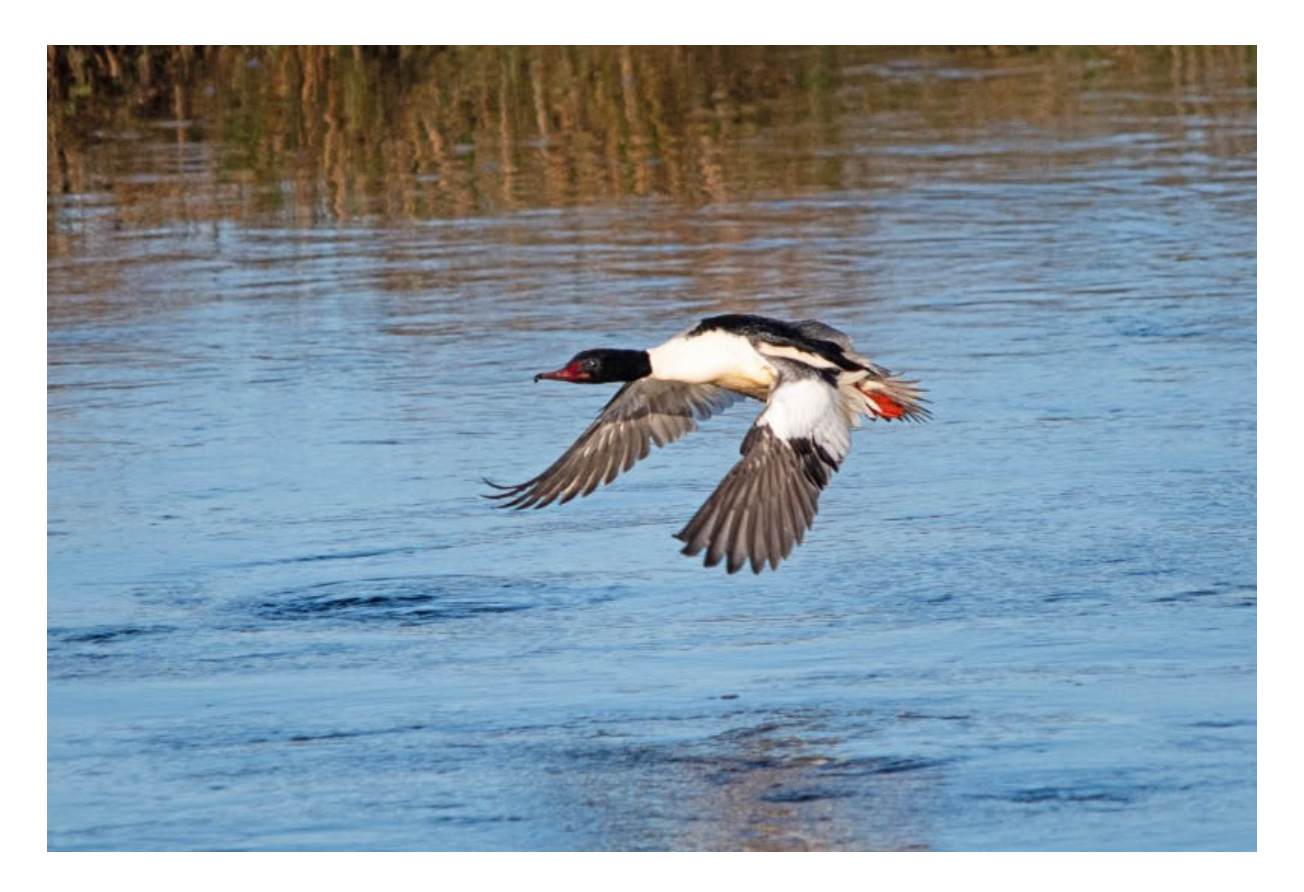
Gwent UKBS Report for December 2019