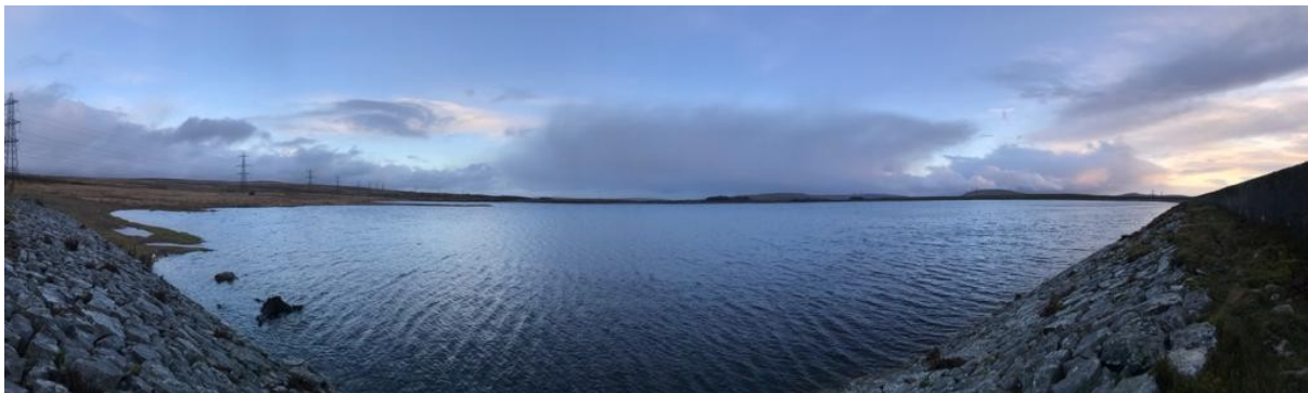
Panoramic view of Garnlydan Reservoir

Of the target species, the total count of Goosander was 73 comprising 59 redheads, 12 males and two other undetermined. Key roost sites were Ponthir, Garnlydan and Llandegfedd Reservoirs which accounted for 44 of the total birds seen. Although the number of Goosander was fewer than that recorded during the river surveys on Friday/Saturday, the total was nevertheless broadly compatible with the last November survey undertaken in 2012.